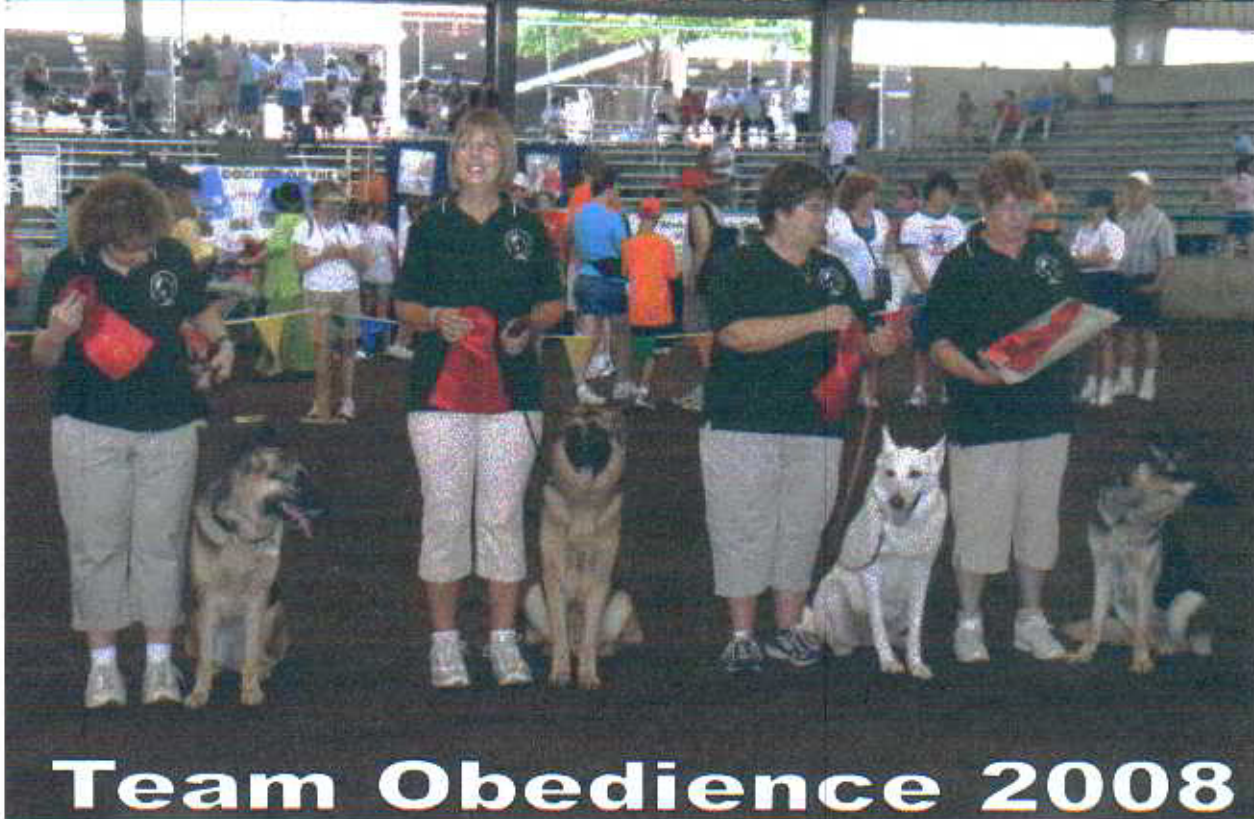
Team Obedience 2008