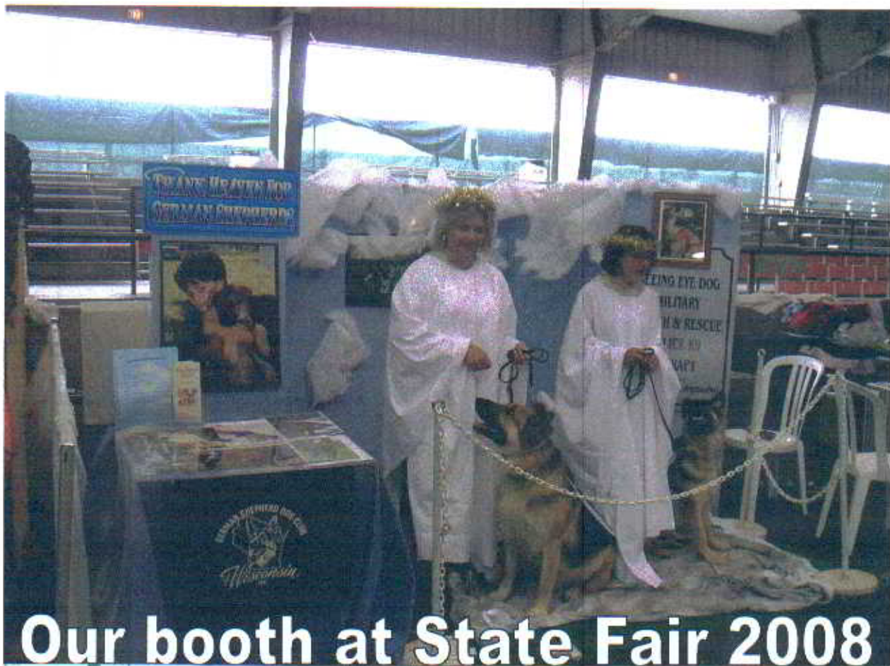
Our booth at State Fair 2008