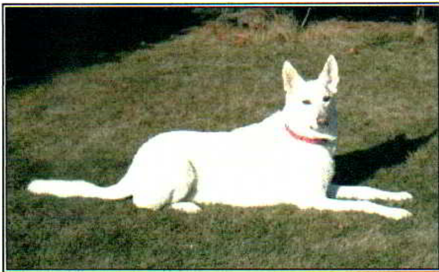
S H A Y N A