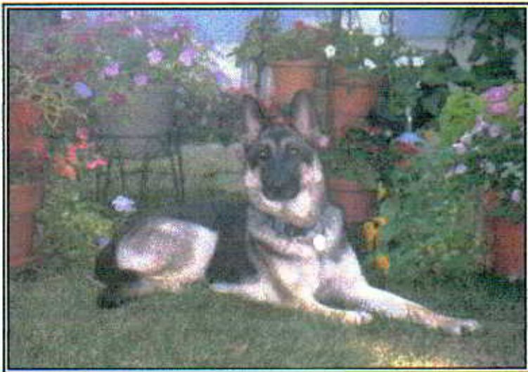
Z E T A