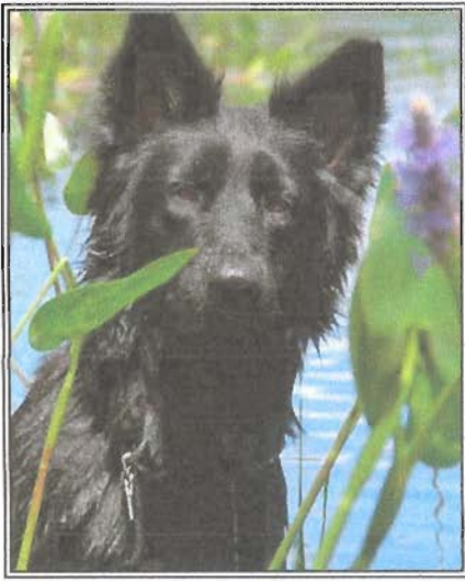
J e t t a R i v e r